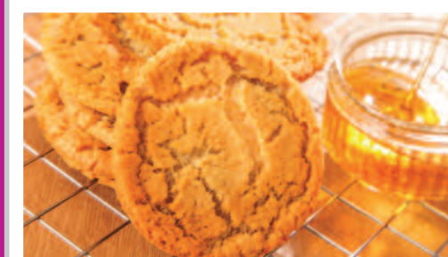
Golden Crunch Cookie

AVAILABLE EVERY DAY – UNLIMITED SALAD, FRESHLY BAKED BREAD, FRUIT YOGHURT & FRESH FRUIT PLATTER. FOR ALLERGEN INFORMATION, PLEASE ASK ONE OF OUR CATERING TEAM. ALL THE ABOVE DISHES ARE SUBJECT TO AVAILABILITY.