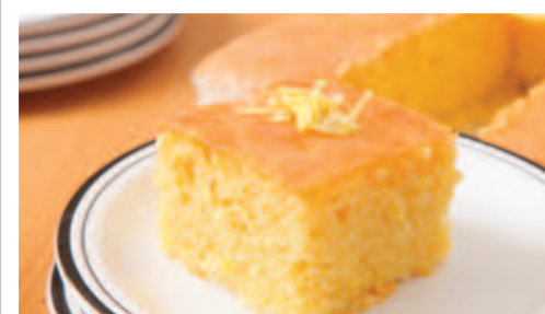
Lemon Drizzle Cake