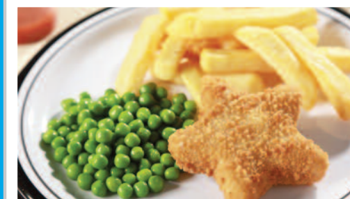
Fish Star (MSC) served with Chips & Peas or Baked Beans