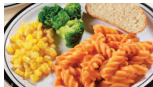
Tomato & Mascarpone Cheese Pasta served with Garlic & Herb Bread and Seasonal Vegetables