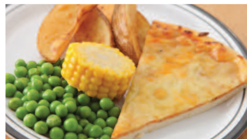
Cheese & Tomato Pizza, served with Potato Wedges & Seasonal Vegetables