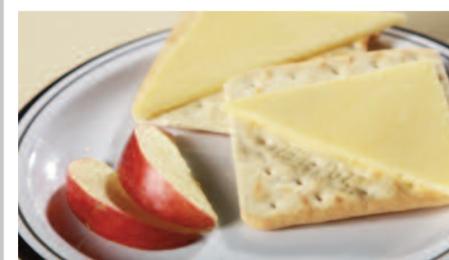
Cheese & Crackers