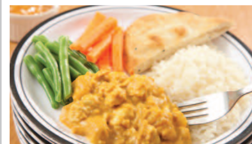
Chicken Korma served with Rice, Naan Bread & Seasonal Vegetables