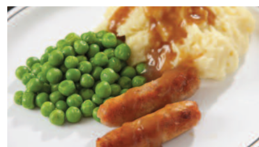
Sausages served with Mashed Potato, Seasonal Vegetables & Gravy