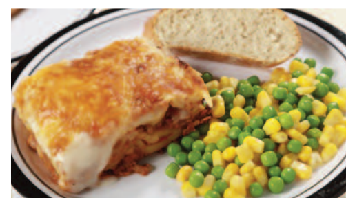
Beef Lasagne served with Garlic & Herb Bread and Seasonal Vegetables