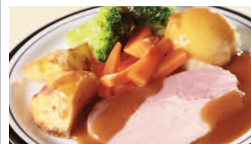
Honey Roast Gammon served with Roast/Mashed Potatoes, Seasonal Vegetables & Gravy