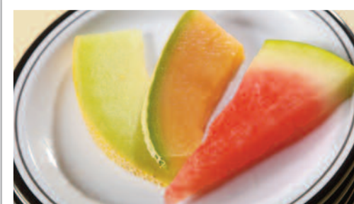
Trio of Melon