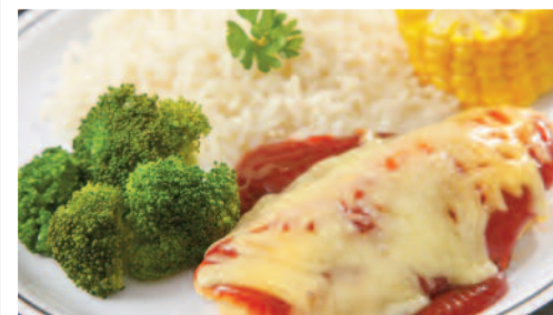
BBQ Chicken served with Savoury Rice and Seasonal Vegetables