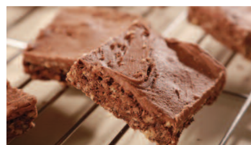
Iced Chocolate Oaty Square