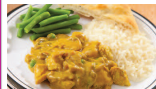
Chinese Chicken Curry served with Rice, Naan Bread & Seasonal Vegetables