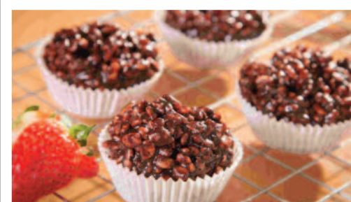
Chocolate Crispy Cake