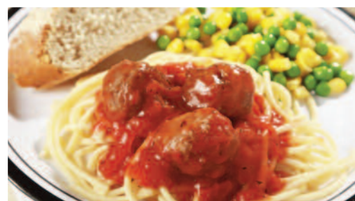
Meatballs in Tomato Sauce served with Spaghetti, Garlic & Herb Bread and Seasonal Vegetables