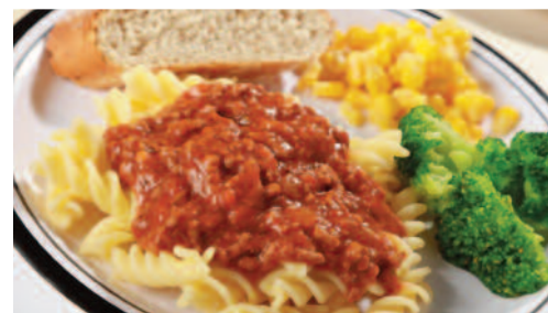
Pasta Bolognese served with Garlic & Herb Bread and Seasonal Vegetables