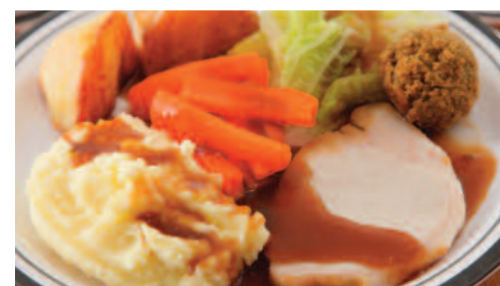
Roast Pork served with Roast/Mashed Potatoes, Seasonal Vegetables & Gravy