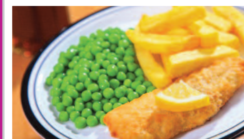
Battered Fish (MSC) served with Chips & Peas or Baked Beans