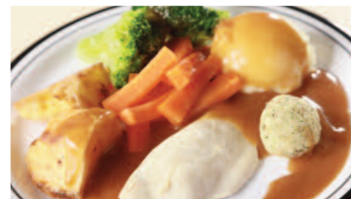
Roast Chicken served with Roast/Mashed Potatoes, Seasonal Vegetables & Gravy